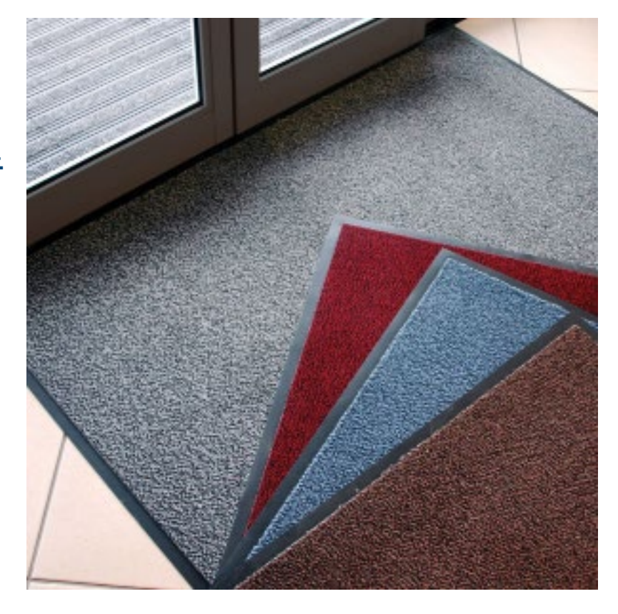
exVAT Prices in UK£/unit