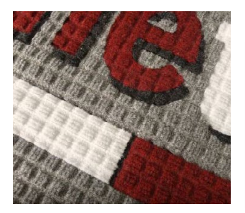
Prices in CAD/unit Prices exclude tax