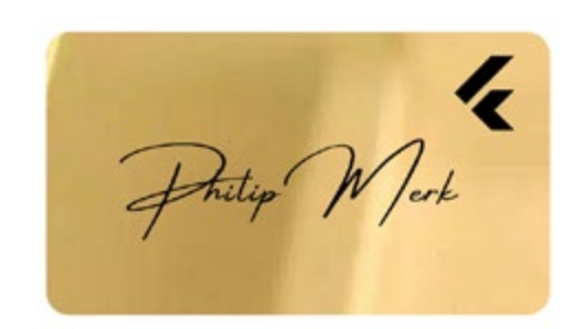
Prices in CAD/unit Prices exclude tax