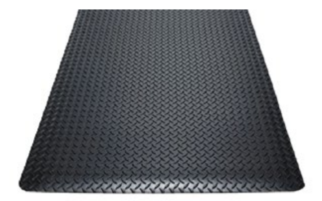
Prices in CAD/unit Prices exclude tax