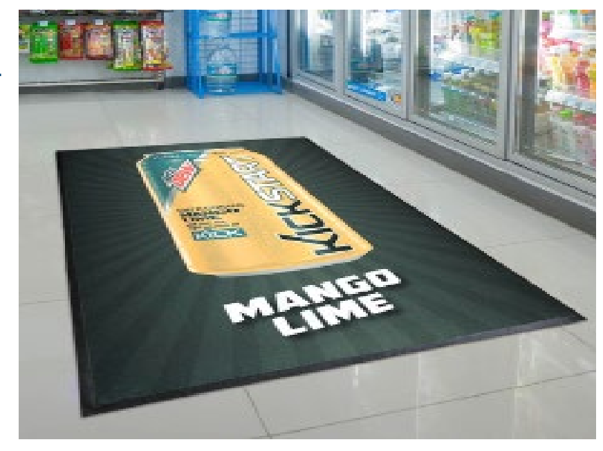
Photo quality image Highly cost effective Promotional medium Standard & Custom sizes available. Bespoke sizes available Anti-slip rubber backing Slimline stay-flat construction